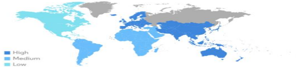
Cybersecurity Insurance Market - Growth Rate by Region